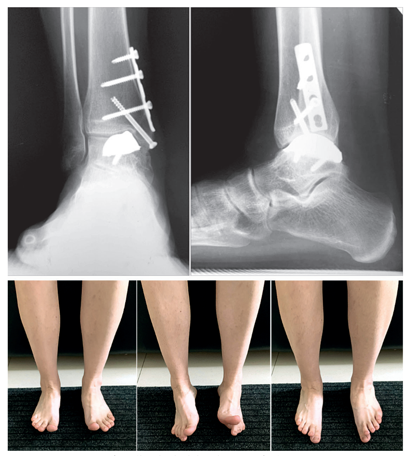
Fig. 3. Clinical and radiological outcomes after 2 years.

results of this technique were generally positive, the expected small patient population prevents drawing any valid conclusions regarding the role of Hemi CAP® in the treatment of OCD of the talus. Custom augmentations allow for solving more complex clinical problems, which may be their significant advantage. The clinical case presented by