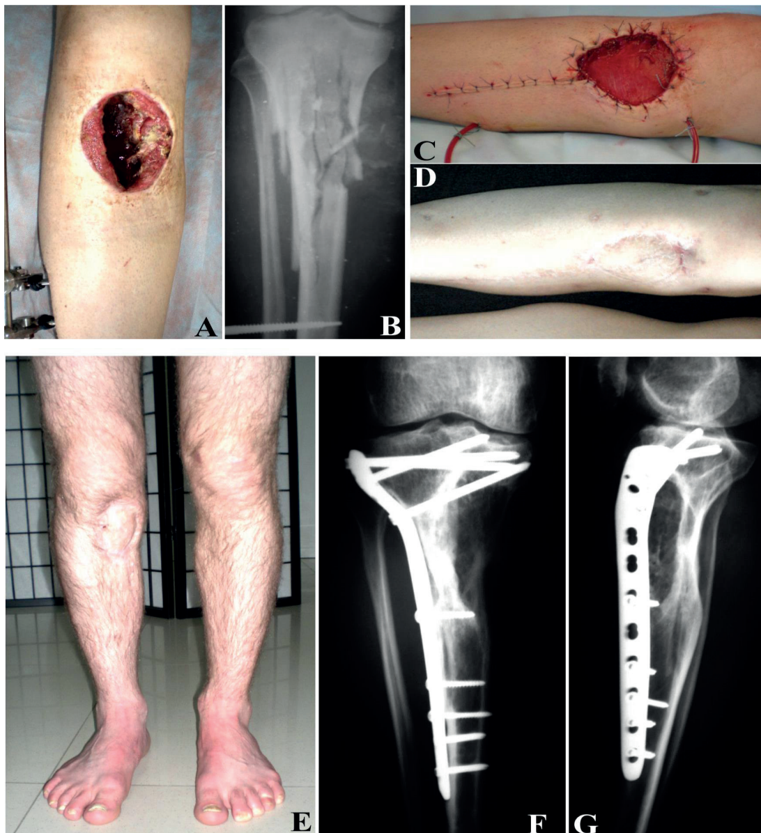
Fig. 2. Gunshot wound to the right lower leg (2015). Specialized assistance – surgical debridement and external fixation of the thigh–lower leg. After 2 weeks, necrectomy and replacement of the tissue defect with the MGF; autodermplasty after 5 days. After 1 month, metal osteosynthesis with a locking compression plate and substitution of the tibia defect by allogenic bone graft. A and B – view of the wound and X-ray of the lower leg 2 weeks after the injury; C – after MGF transposition; D – a month after autodermplasty; E, F, G – view of both lower limbs and X-rays of the right lower leg 1 year after osteosynthesis and bone grafting

Early and reliable closure of a soft tissue defect in some cases allows preserving a functioning limb [3]. Among our observations, there were 3 such cases; the use of MGF made it possible to carry out adequate control of infection in the early stages of treatment, which enabled further orthopedic reconstruction (Fig. 2).